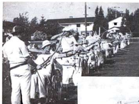
Some Wheel-chair Archers on the line.