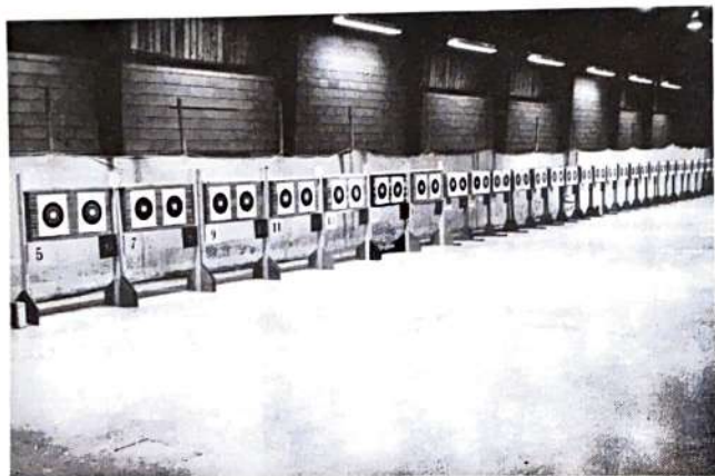
Seventy targets all in a row