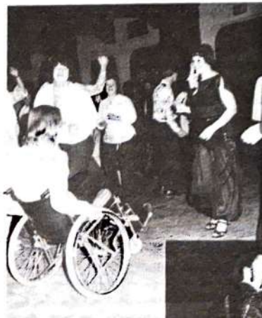
showing how it's done.