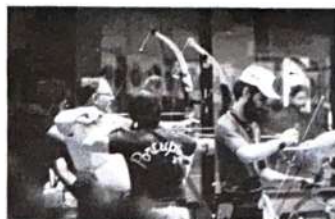
The Pro line