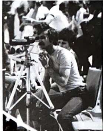
An interested viewer