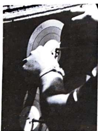
Some close measurements