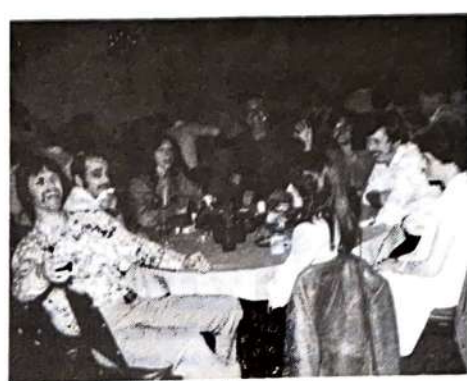
The Prince George crew